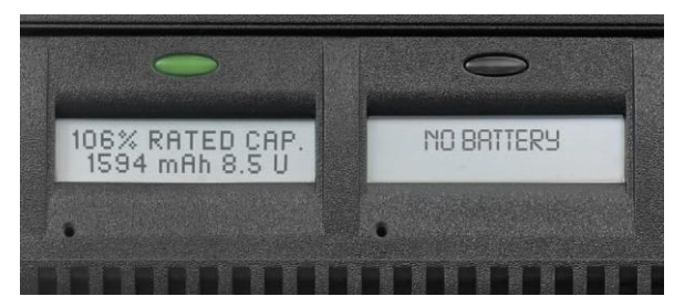
Display shows battery capacity, voltage, charge status and more, in real time.

decisions on battery replacement. With non-display chargers there is still valuable information about the status of the battery available from the LED display. When the time is approaching that you need to replace your battery the LED display on the charger will display a flashing green and red indicator. This warning will act as a preventative so you don't get caught out with an exhausted battery.